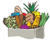
Food Pantry Needs

Mailing Address: 1169 Clark Street, SW Covington, Georgia 30014