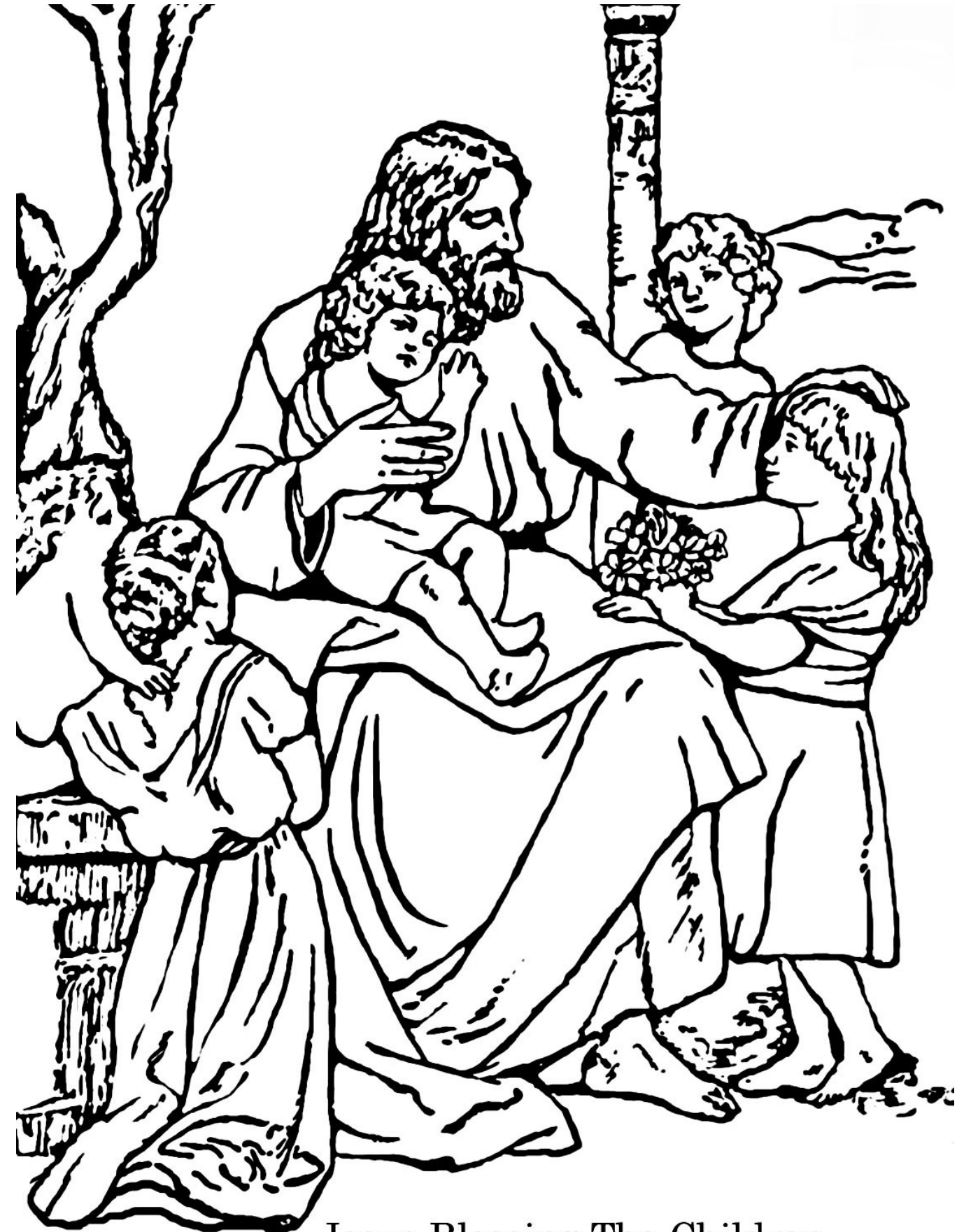
Jesus Blessing The Children