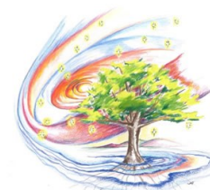
A New Heaven and a New Earth

The Presbyterian Association of Musicians (PAM) sponsors two identical Worship and Music conferences at Montreat Conference Center each summer. These conferences, guided by the principles of Reformed worship, provide opportunities for vital worship experiences and offer venues to explore various ways to enrich the liturgical life of the local church. During the 2013 conference, conferees participate in choirs, instrumental playing, handbell ringing, liturgical