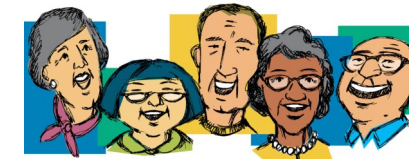
Fun for the Saints

The Silver Saints and the Ambassador Choir met together on May 7th. It was a great time. Since then things have occurred to change the original tentative calendar. The Silver Saints have temporarily become the Greatest Generation (again) and enjoyed lunch together at Stalvey's Restaurant on Thursday July 9th. A group of 12 attended including a new couple. This makes our first time together a success. The plan for the future will be as we did in July. An announcement will be in the bulletin and newsletter, the date will be indicated, the time always will be 11:30, the place will be identified and a reminder to call the church office to confirm attendance will be requested.